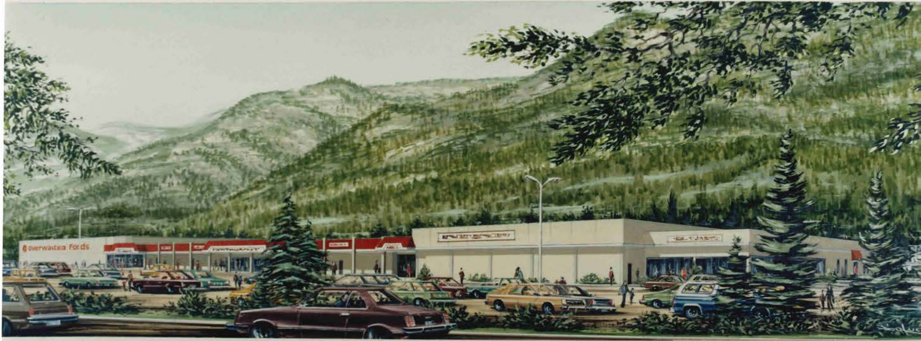
Greenwood Mall - Sparwood - B.C.